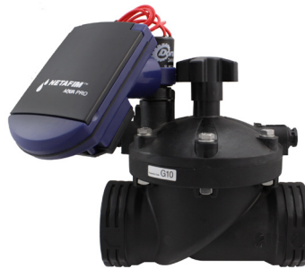
2-WAY BATTERY OPERATED CONTROL VALVE (2" SERIES 80 ELECTRIC VALVE SHOWN)