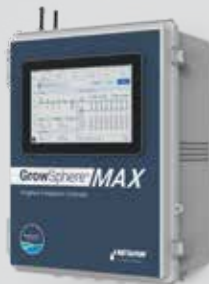
GrowSphere™ MAX with screen