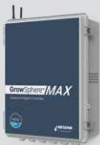
GrowSphere™ MAX without screen