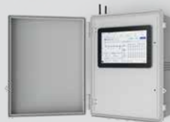
GrowSphere™ MAX double door with screen