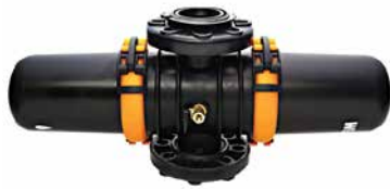
3" TWIN LITE