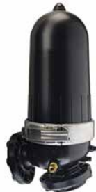
3" ANGLE FL