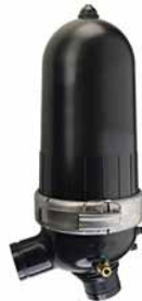
3" ANGLE GR