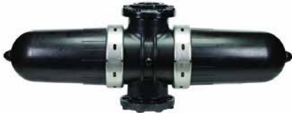
4" OR 6" TWIN